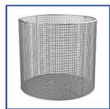
Mesh bottom basket(optional)